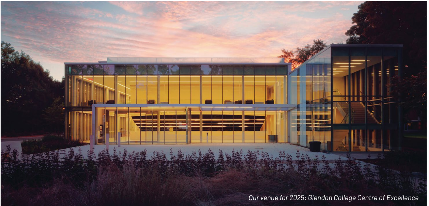
Our venue for 2025: Glendon College Centre of Excellence

Showcase your brand and connect with this targeted audience.